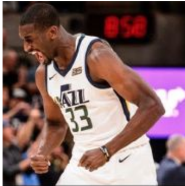
EKPE UDOH (Golden State/Milwaukee/Utah/ Overseas...Beijing/Bologna)