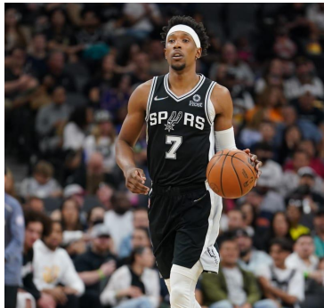
JOSH RICHARDSON (Miami/Phil./Dallas/Boston/ San Antonio/ Miami)